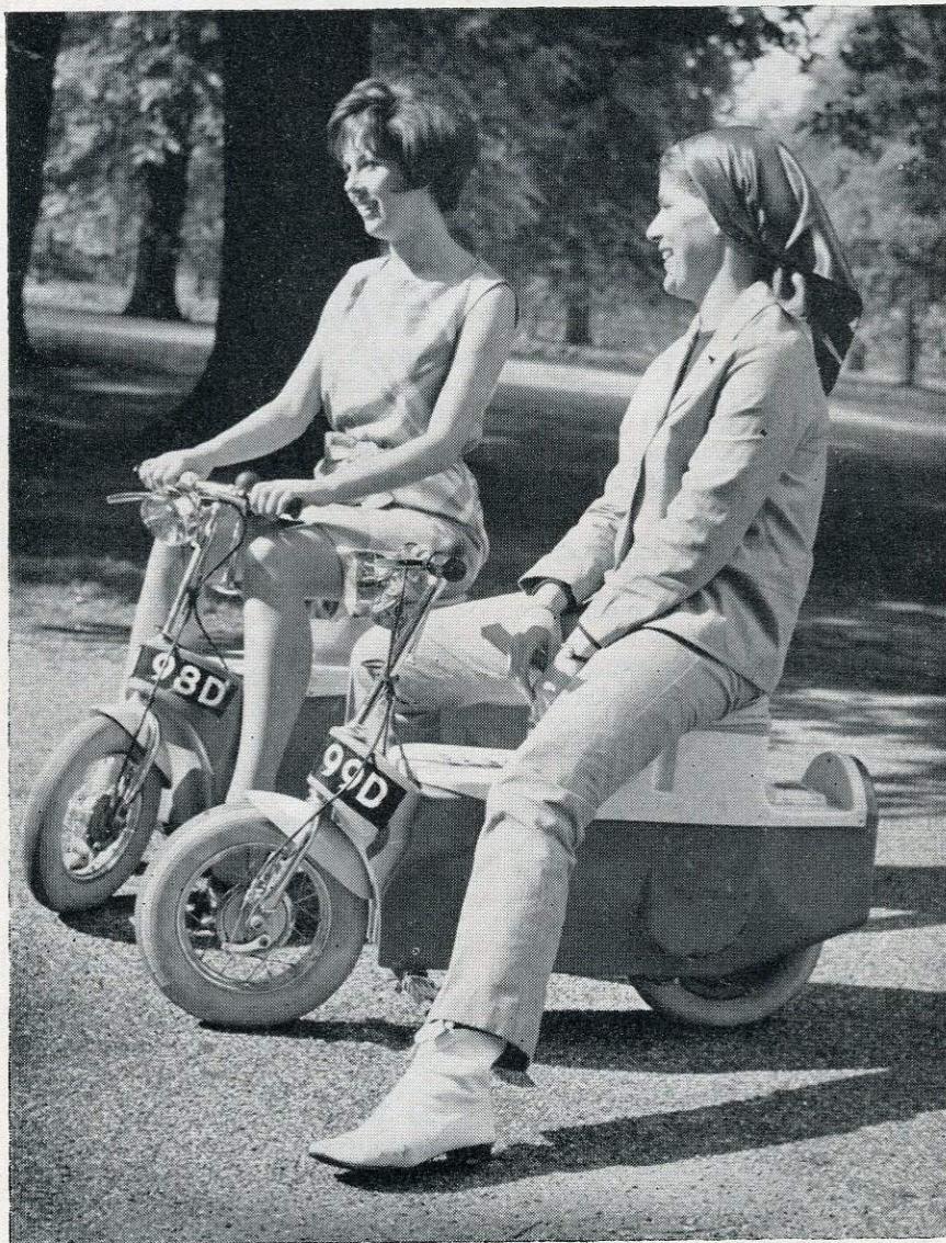
Right: the new Winn City Bike .

The Winn City Bike is being marketed by HIGH SPEED MOTORS LTD. of Witney, Oxfordshire at £95. Power & Pedal have already arranged to road test the Bike and to visit the factory. Fuller details will appear in a later issue.