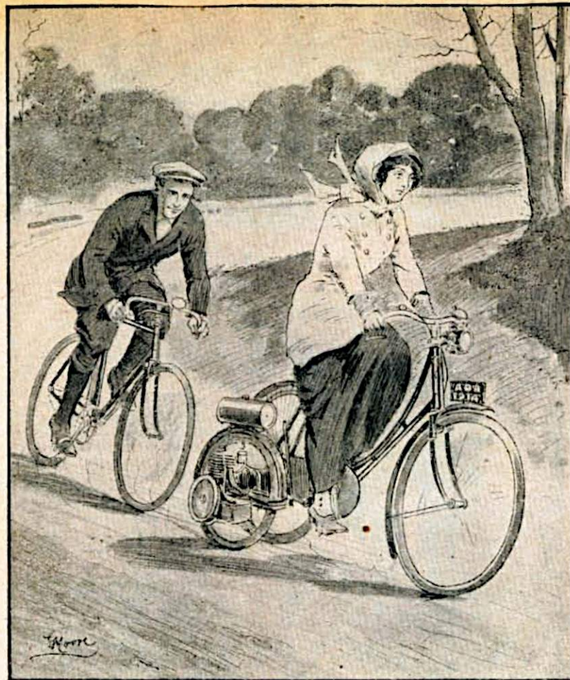
A training spin behind a fair Auto-Wheelist. This will not be an uncommon sight in the future.

A good deal of feeling has been aroused in the Midlands by the recent In view of the seriousness of these complaints, I asked