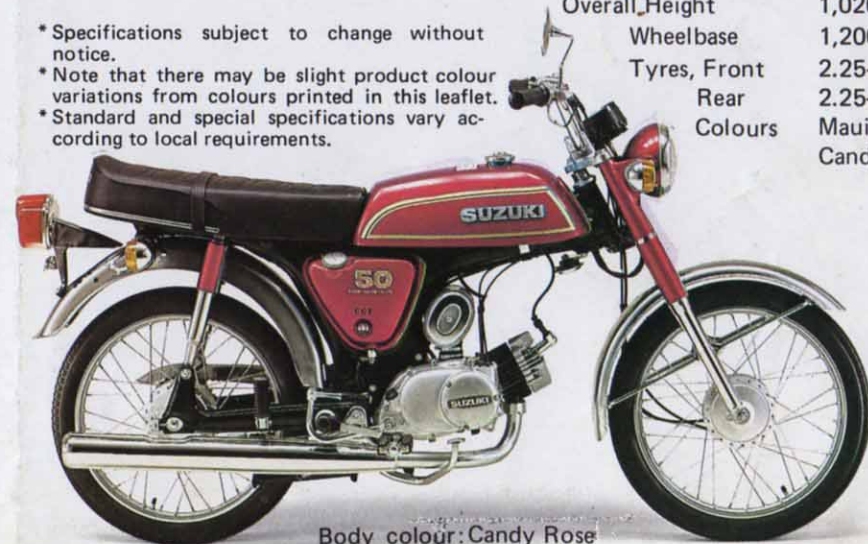
Body colour: Candy Rose