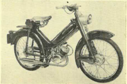
THE 1960 NORMAN MOPEDS: The Super Lido, the Nippy mark IV and the Nippy mark III.