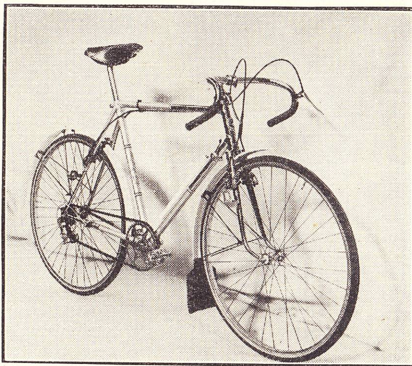
Model No. G 48 in the New Hudson range, the "Silver Featherlight," also described below

Williams C 34 44-teeth flanged chain-wheel and 6½ in. fluted cranks form the front section of