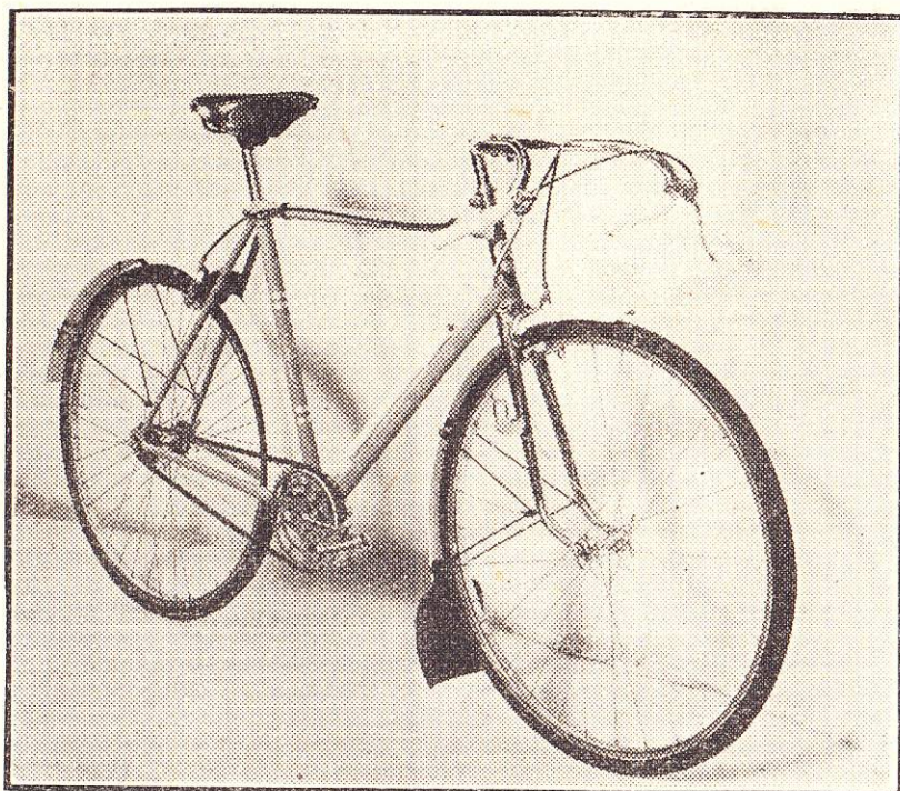
The New Hudson "John o' Groats" Model No. G 52, which is fully described on this page

mudguard eyes and boss for detachable lamp-bracket, Tecalemit grease gun lubrication to bottom and top head races.