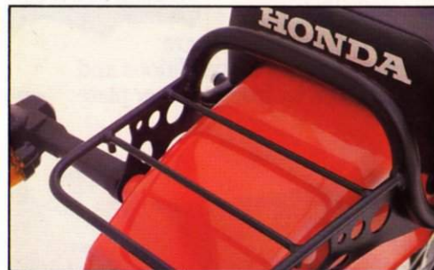
Standard, big-capacity carrier