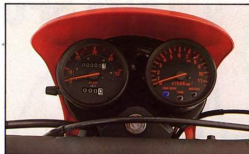
Easy-read instruments, screen and padded handlebar