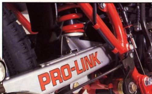
Unique Honda Pro-Link suspension

The MTX50 can be ridden on a moped or full car licence.