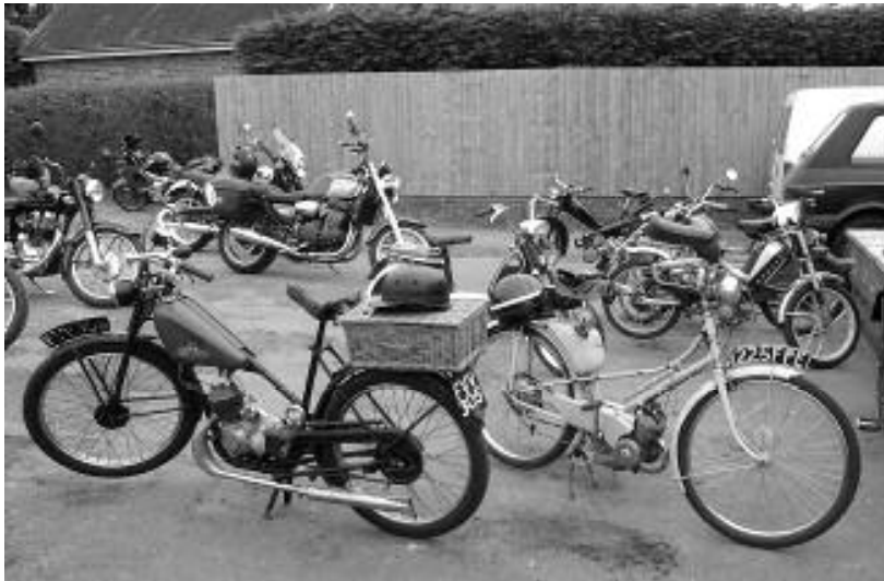
At the lunch stop

After all the expenses we were able to contribute £41 to club funds.