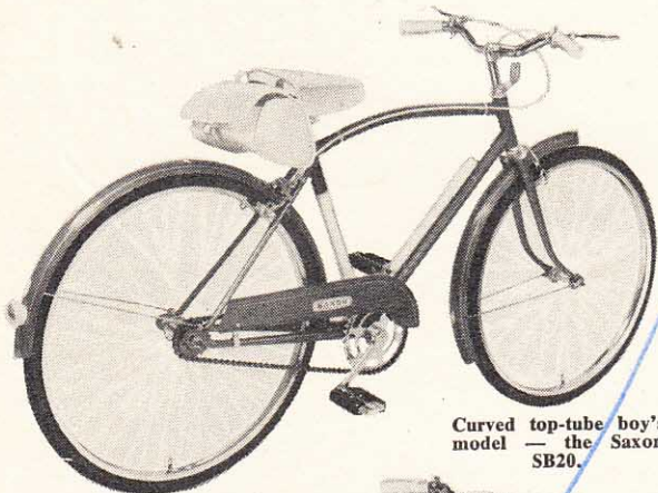
Curved top-tube boy's model — the Saxon SB20.

Equipped with 20in by 1½in wheels the Saxon 20 should be a good seller at £15 13s 3d,