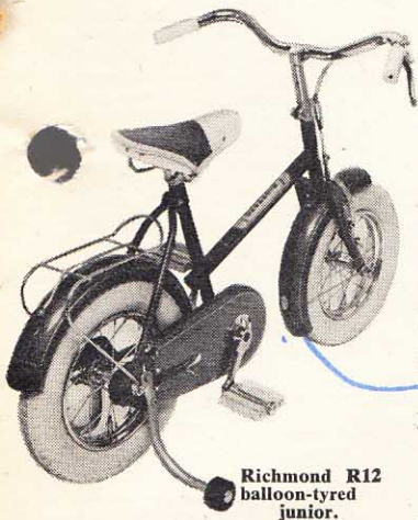
Richmond R12 balloon-tyred junior.