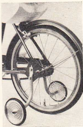
New style R16 stabilizers by Richmond.