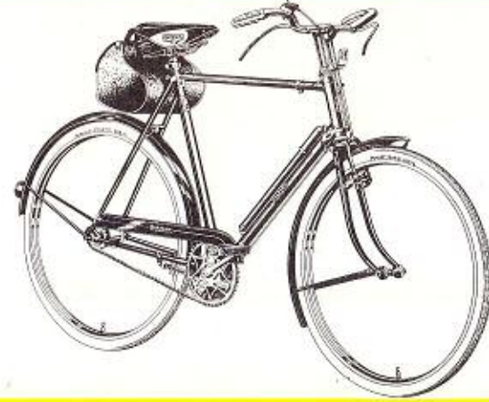
RALEIGH 'DAWN' LIGHT ROADSTER (Model 11)

The cycle with everything for the connoisseur. Its many features include thief-proof lock, prop-stand and fully enclosed gearcase, and a filter-switch lighting unit which provides a light when stationary. Superbly finished in Raleigh Green with Gold decoration. For Ladies and Gents.