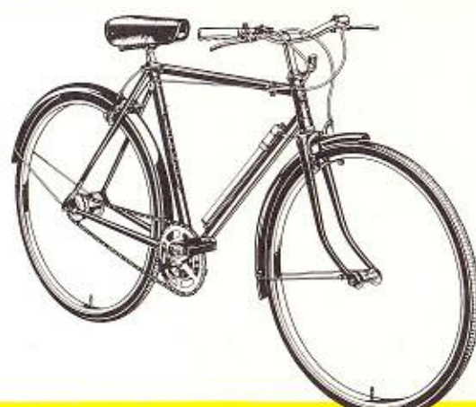
TRIUMPH TRAFFICMASTER (GENT'S) (Model 409)

Continuing the trend in high quality at low prices, this model in varied specifications provides town transport at a most economical level. Beautifully finished in Royal Blue with Gold lining for both Ladies and Gents.