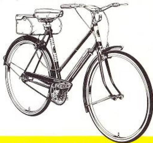
TRIUMPH PALM BEACH TOURIST (Model 429)

In Royal Tan — Bronze Green — Electric Blue or Carmine. Flamboyant finishes with contrasting head and panels.