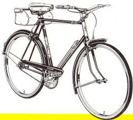
RALEIGH RIVIERA SPORTS LIGHT TOURIST (Model 90, Model 90L)

In exciting iridescent, trend-setting colours, the new Light Tourist is styled and finished to a high degree of excellence. A quality bicycle in the Raleigh tradition for those for whom only the best is good enough.