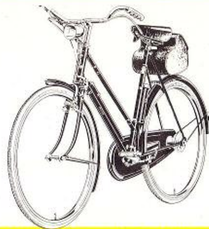
RALEIGH 'DAWN' TOURIST (LADY'S) (Model 12L)

For those who prefer a really light roadster with roller lever brakes, this all-purpose bicycle is designed to give years of trouble-free cycling. Finished in gleaming black with gold decoration.