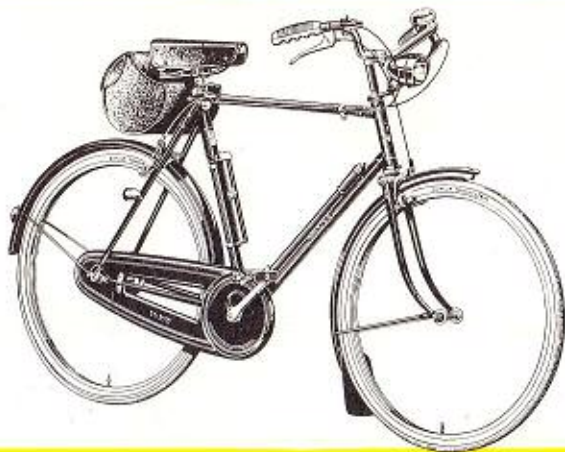
RALEIGH SUPERBE SPORTS TOURIST (Model 24)

Palm Beach — conjuring up pictures of gay colours and carefree days. Aptly named, these Triumph models in their bright glossy finishes of Red and Cream or Pale Blue and Electric Blue with Whitewall tyres are designed with pleasure in mind. High quality equipment includes large saddle bag.