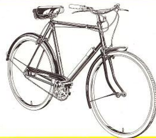
B.S.A. 'WAYFARER' LIGHT TOURIST (Model 518)

A model embodying all the features the discerning cyclist appreciates. An ideal all-purpose machine, sturdily built to withstand the rigours of everyday cycling. Finished in Black with Gold lining to the same high standard as all the Raleigh range. Available with Sturmey-Archer 3-speed gear combined with a 'Dynohub' hub lighting unit. Gent's (Model 12) also available.