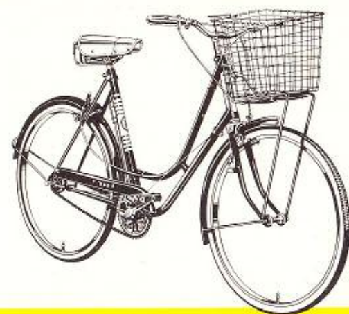
B.S.A. 'SUBURBAN' (Model 519L)

The amazing new Trafficmaster represents a major breakthrough in cycle value. Never before has such quality been available at the price. Lasting glossy finish in Green with Gold lining and non-tarnishable bright parts, 3-speed Sturmey-Archer gear as standard equipment. Sets the trend in value for money. Lady's (Model 409L) also available.