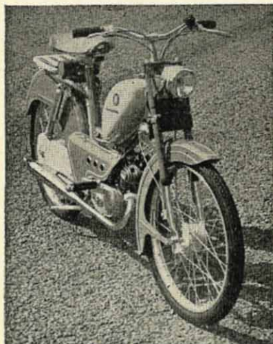
BELOW: The Super deluxe also with alternative gearboxes.