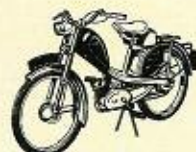
2 SPEED GADABOUT 49 c.c. Villiers engine with unit construction 2-speed gearbox. Price inc. speedometer. Price 64 gns.