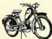
3 SPEED GADABOUT DE LUXE 49 c.c. 3-speed gear- box with positive twist-grip gear change. Price inc. speedometer. Price 74 gns.