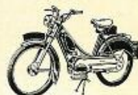
PANDA PLUS 49 c.c. engine. Hand operated clutch. The newest addition to the Phillips Range. Price 54½ gns.