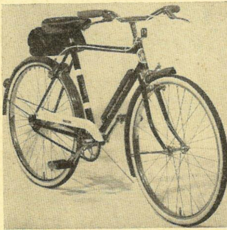
PHILLIPS JUNIOR SPORTS—A great machine for the younger generation.

In the Phillips' Sports range a new model makes its debut—the Valiant (models P13 and P14) finished in flamboyant blue or flamboyant Italian red. It has light-blue head and peaks