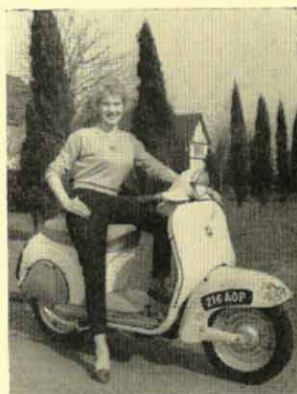
THE NEW JAMES SCOOTER sells at £165.