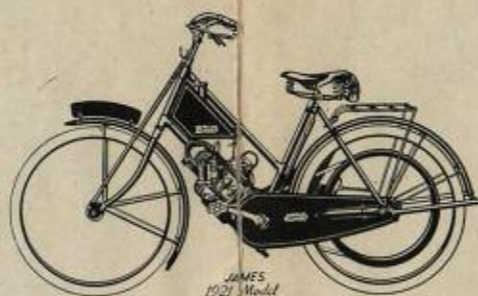
"THE PIONEER," THE JAMES 1921 MODEL

£25 Nett Cash Ready for the Road INCLUDING SPEEDOMETER 120 Miles Per Gallon 25 Miles Per Hour