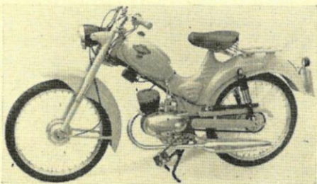
NEW ITOM MOPED: Latest moped to be imported by Adimar is this smart model called the Esperia de-luxe. Price is £84 0s. 0d.

Twelve models make up the range of bicycle bells marketed by C. J. Adie and Nephew Ltd., of 156 Warstone Lane, Birmingham, 18. Bells are the main product of this long-established company, but it also manufactures such cycle accessories as pump connectors, locks and handlebar end-stops. For the coming season, no changes have been announced.