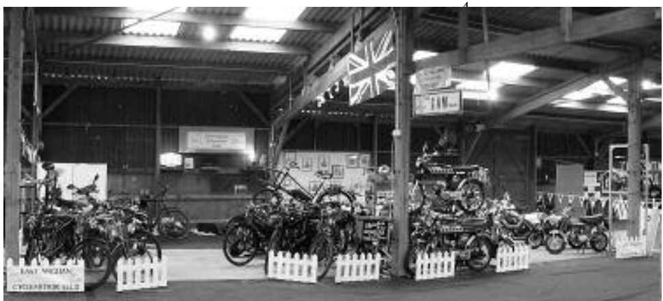
EACC Stand at Copdock Show