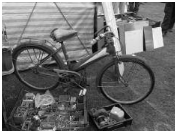
Presto/Mosquito on Pete Stratford's stand at Founder's Day

identical machine for sale at the VMCC Founder's Day Rally in July.