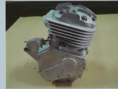
Right hand view of the engine assembly