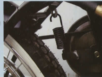
Upgraded tension adjustment unit for the automatic centrifugal clutch