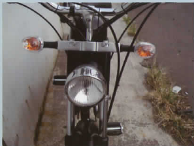
Headlight with the front turn signal set

A New Cruzer Motorbike is packed by 4 shipping boxes as a SKD version. Follow our website assembly instructions, a New Cruzer Motorbike can be built easily by regular tools. A New Cruzer motorbike has the upgraded parts ceramic cylinder, auto centrifugal clutch with tension adjustment, rear drum brake, front drum brake, big breather kit, seat with layback post, new frame, heavy duty front fork and turn signal sets different than a Whizzer NE5 bike. If any further question, please contact with the following dealer.