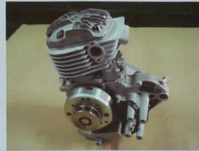
Left hand view of the engine assembly