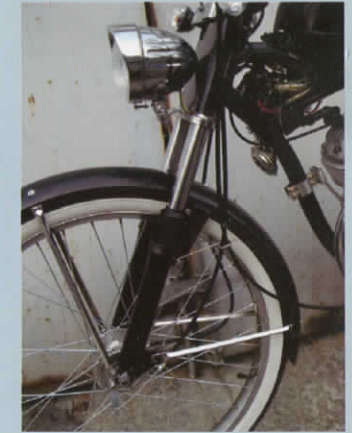
Heavy duty front fork unit

A New Cruzer Motorbike is packed by 4 shipping boxes as a SKD version. Follow our website assembly instructions, a New Cruzer Motorbike can be built easily by regular tools. A New Cruzer motorbike has the upgraded parts ceramic cylinder, auto centrifugal clutch with tension adjustment, rear drum brake, front drum brake, big breather kit, seat with layback post, new frame, heavy duty front fork and turn signal sets different than a Whizzer NE5 bike. If any further question, please contact with the following dealer.