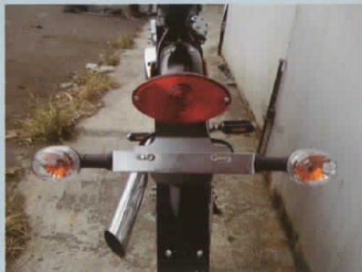
Taillight with the rear turn signal set