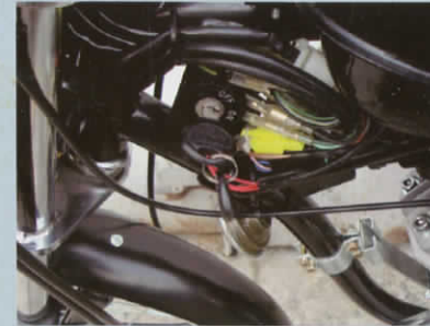
Key switch unit