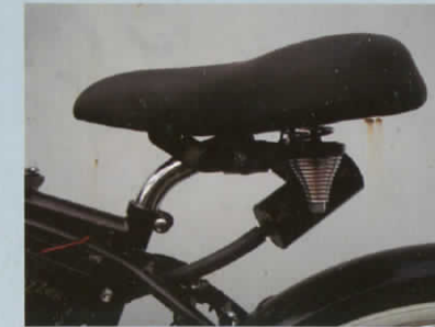
New seat with layback post and big breather canister installation

WEST COAST CRUZER 57-A DEPOT RD GOLETA CA 93117 E-MAIL: 1westcc@gmail.com 888-748-8898 EBAY WORLD57GOLETA