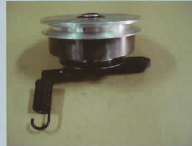
Auto centrifugal clutch unit