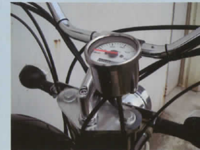
Speedometer installation on handlebar