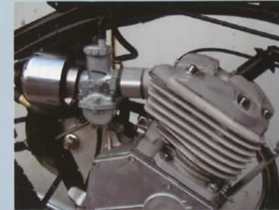
Ceramic cylinder with keihin PTF carburetor unit and its intake manifold