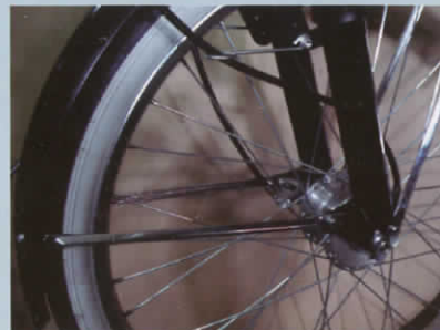
Front drum brake with its upgraded installation and the speedo gear setup