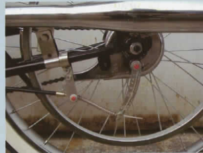
Rear drum brake installation