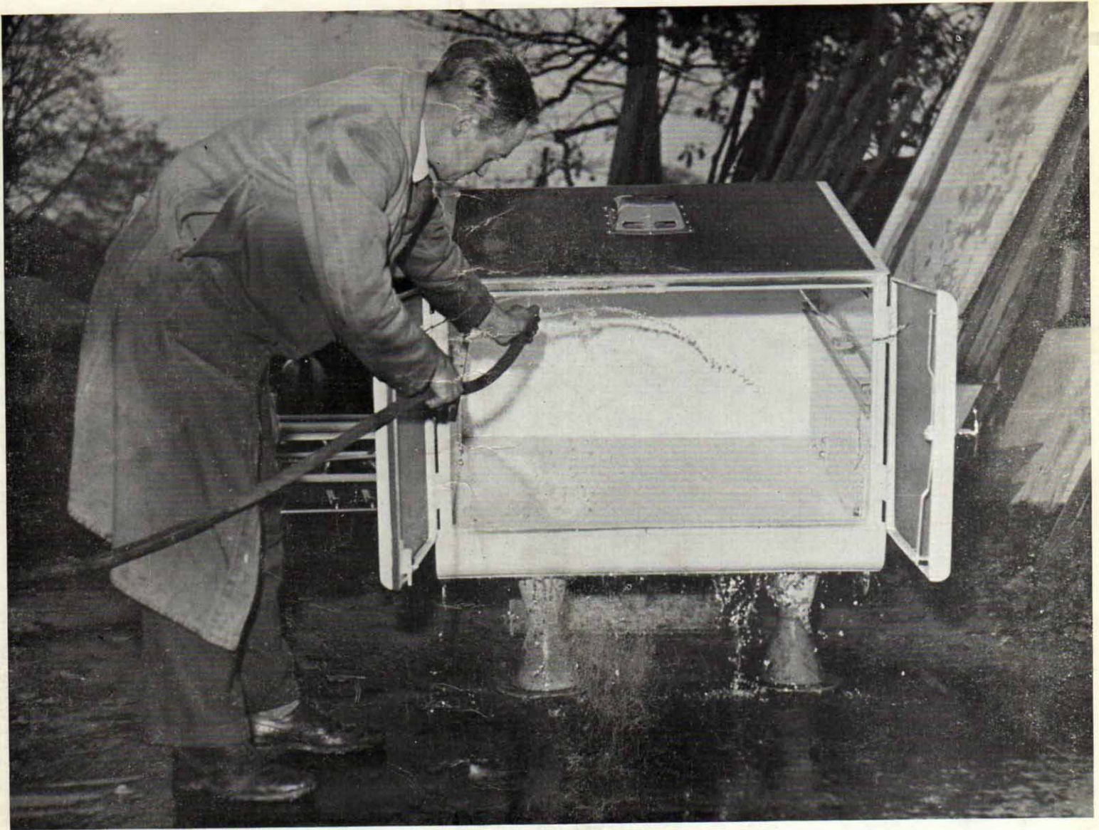
Ply floor cover removed for hosing, note quick draining of water through special full width aperture in steel floor.