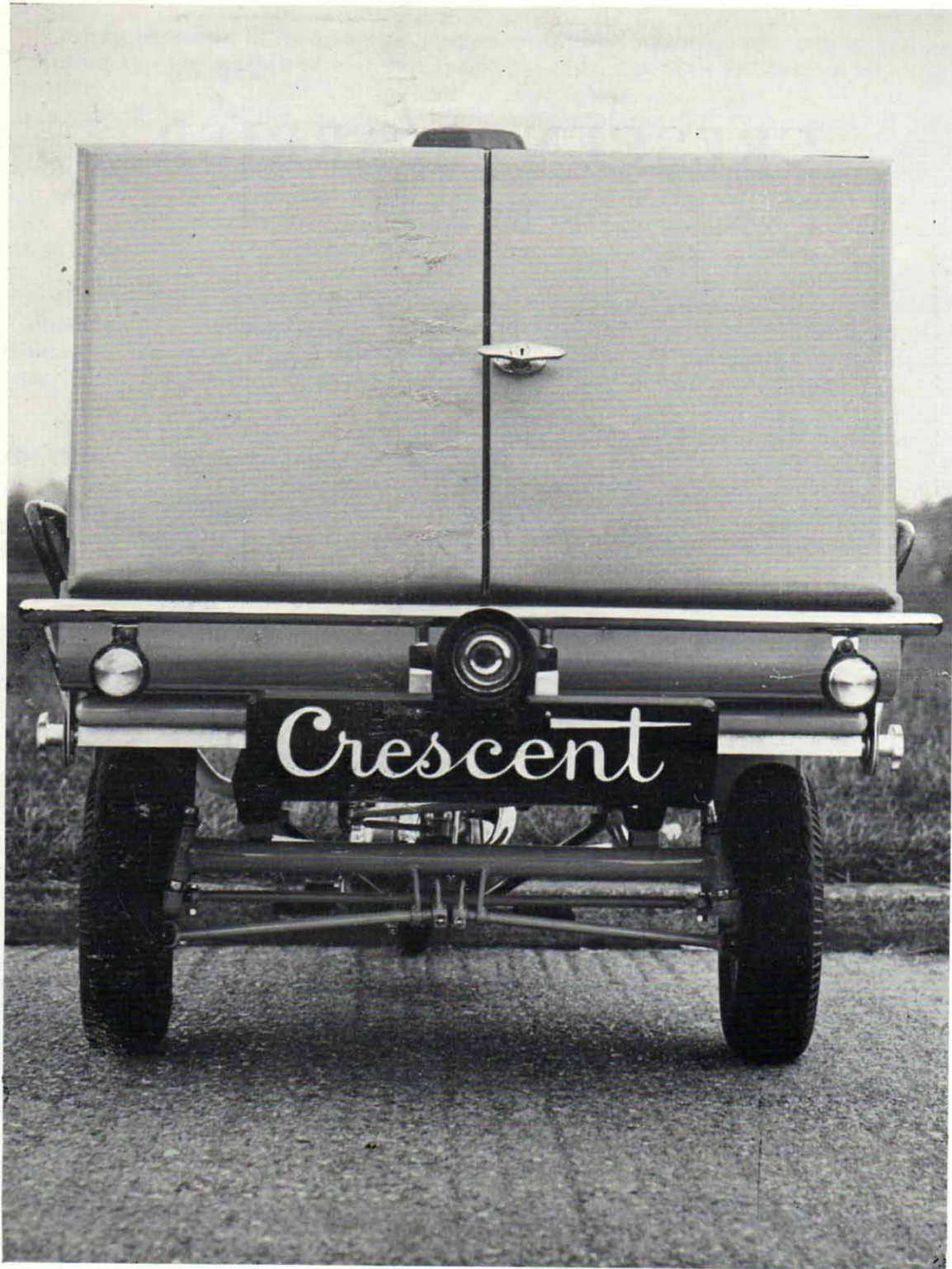
View showing extra strong front axle beam. Note the unique suspension and robust brake mechanism. 3 front lamps are all rubber obviating damage when loading.