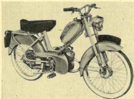
THE AUTO-VAP DE LUXE MODEL, with occasional seat, price 58 guineas.