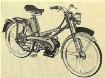
THE STANDARD AUTO-VAP MOPED, is extremely simple to operate.

Further details of the new mopeds and their