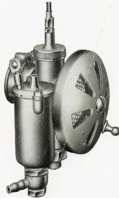
Typical Type 391 Carburetter.

Air filter elements are fitted in the main air intake, also a strangler to assist in cold starting by closing a revolving shutter.