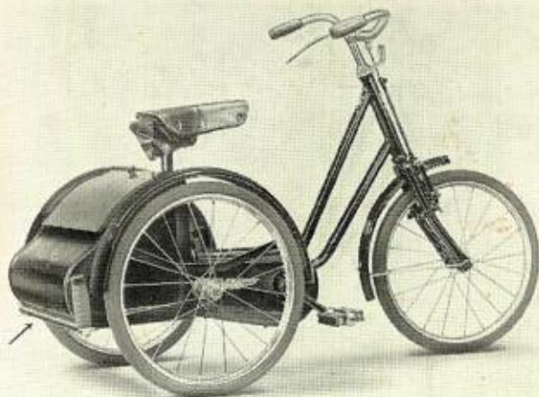
Aberdale model with luggage boot and control handle